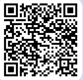
Issues with the QR code? Visit: https://tinyurl.com/ucvtstechsupport http://ucvts.org/mysupport http://ucvts.org/techdept

Can't access the form? Ask a friend, counselor, teacher, etc. to submit the form on your behalf.